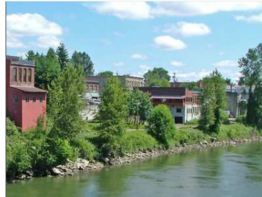
Snohomish River and Historic First Street

Washingtonians will be hit hard. According to the Tax Foundation, the average middle income-family will see its take-home income fall by $1,574 next year alone.