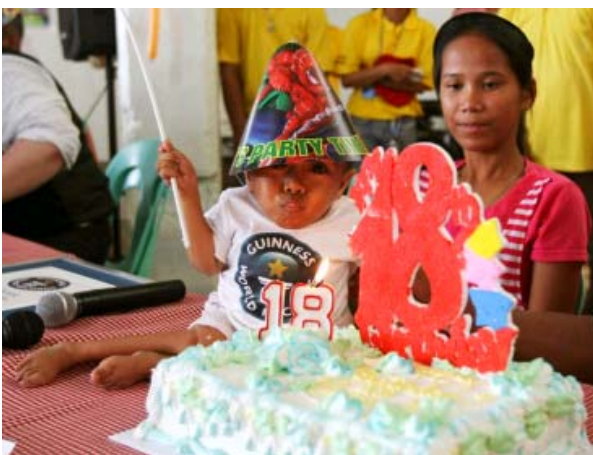
Meet world's shortest man, Junrey Balawing