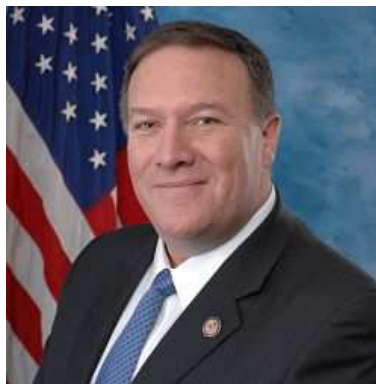
Pompeo says he doesn't know the Koch brothers ... well.

Sunday's Washington Post shined a spotlight on U.S. Rep. Mike Pompeo , the Wichita Republican whose campaign last year drew more cash from Koch Industries than any other candidate's.