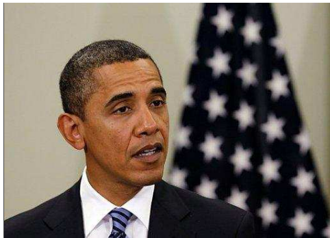
President Barack Obama, pictured on November 13, will be walking a fine line at the upcoming NATO summit between upholding his pledges to withdraw US forces from Afghanistan and domestic opposition to a strict calendar, experts said Tuesday.

President Barack Obama will be walking a fine line at the upcoming NATO summit between upholding his pledges to withdraw US forces from Afghanistan and domestic opposition to a strict calendar, experts said Tuesday.