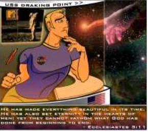
Laus Deo >>